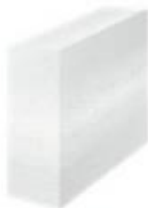
Polystyrene foam EPS

Type of insulation material with which the fastener is to be used